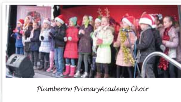
Plumberow Primary Academy Choir