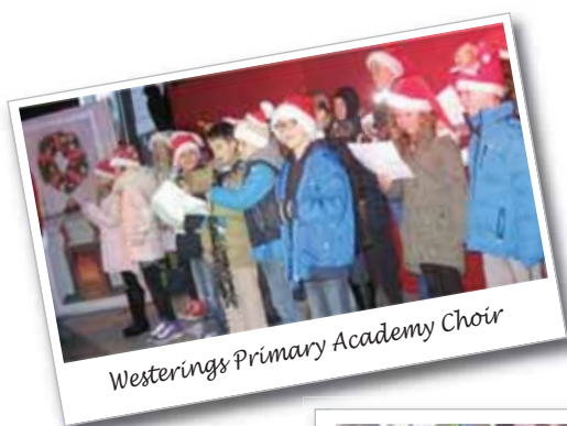
Westerings Primary Academy Choir