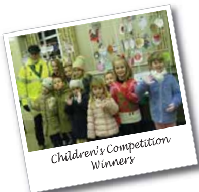
Children's Competition Winners