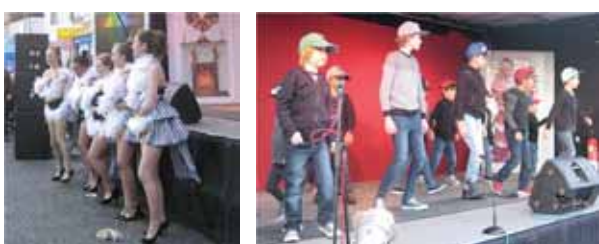
Hildale Academy of Performing Arts