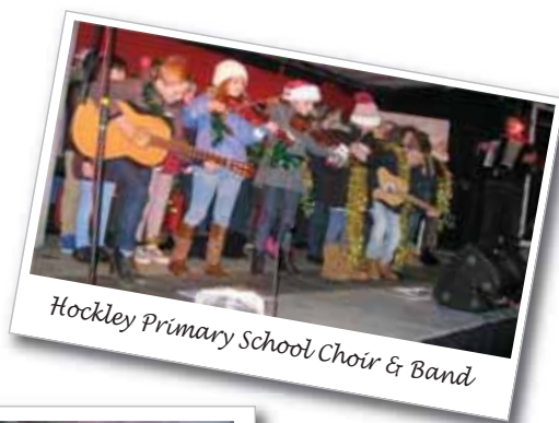
Hockley Primary School Choir & Band