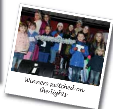
Winners switched on the lights